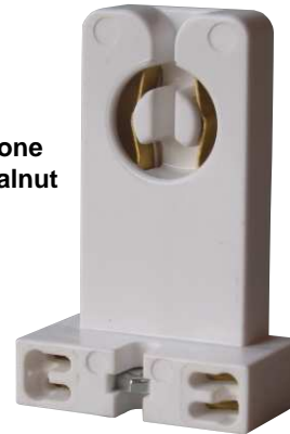
1551.P Turn style tombstone lampholder with palnut

Special: Item can be factory wired per customer specifications for length, strip and wire material.