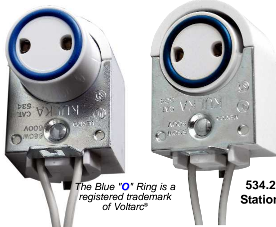
534.1K™ Spring Loaded

Housing: White urea Contacts: Silver-plated phosphor bronze Gasket: Blue silicone treated neoprene Termination: Lead wires 9" (228.6 mm) long, 1 stranded and tinned lead wires, 1/2" stri standard. Wire rated: AWM 1000 V, 90°C (194°F).