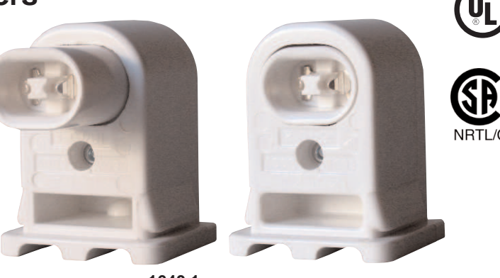
1640.1 Spring Loaded

No. 18 AWG solid copper wire with 3/8" strip length.